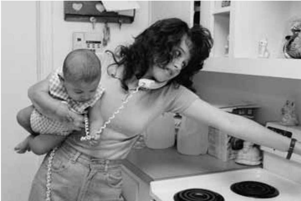
Younger children are at the greatest risk for maltreatment.

to 3,058,129 in 2001 (51 children per 1,000). It is doubtful that these figures represent anywhere near this large an increase in the actual number of children being maltreated. Rather, the figures probably reflect factors that increase the likelihood that incidents will be reported, such as the allocation of more federal money for reporting; the strengthening of state reporting laws (physicians, teachers, social workers, and other professionals who work with children are now required to report in all states); the redesign of state social service intake systems; the implementation of 24-hour hotline systems; and the massive public awareness campaigns of the 1970s. The rate of increase in estimates of child maltreatment began to slow in 1990 and appeared to have leveled off by 1994.